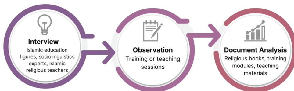
Figure 1. Example of Image Writing.

models related to sociolinguistics in practical activities. Subsequently, data triangulation was performed by comparing and validating findings from various data sources to ensure the reliability and validity of the research findings. Finally, the analyzed data were used to make interpretations about the effectiveness and relevance of Islamic educational models related to sociolinguistics in preventing cases of sexual bullying in educational institutions. By following these steps, researchers could conduct comprehensive and in-depth data analysis to understand the implications and outcomes of the research conducted.