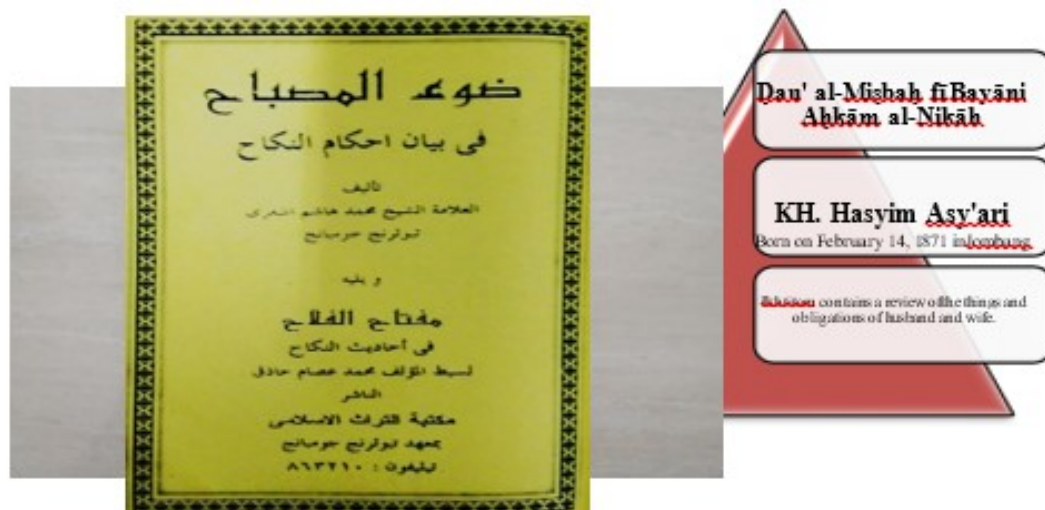
Figure 1. Dhau' al-Misbah fi Bayani Ahkami al-Nikah

In the book Dau' u al-Misbâh fî Bayâni Ahkâmi al-Nikâh , as the reasons he wrote in his work. He captured how at that time, many young people wanted to get married, but did not know the terms and conditions of marriage, the rights of a wife to her husband and vice versa. They also did not know about the procedures or manners in marriage, so many