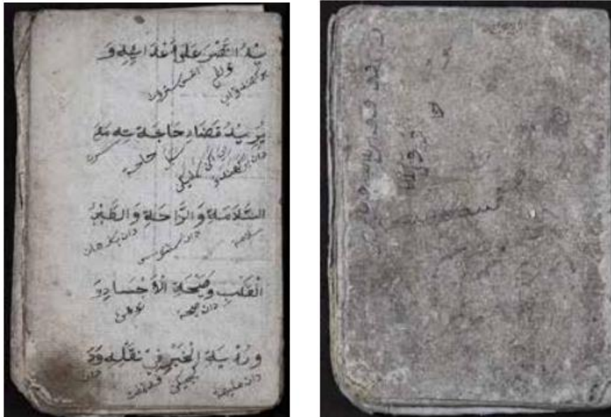
Figure 1 (left): A manuscript without cover

method uses documentation by reading, reducing, and categorizing data according to an inductive flow (Dufour & Richard, 2019).