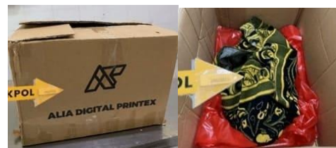
Figure 1. Objects found within the body

The baby girl's body was covered with a brown cardboard box marked "Alia Digital Printex", wrapped in a red plastic bag, a green, black, and yellow floral prayer mat and another red plastic bag, and the body was wrapped in a grey and dark blue sweater, (see Figure 1).