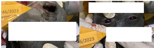
Figure 3. Blueness of the mucosa of the lips and dilation of the eye's blood vessels.

External examination also shows other signs of asphyxia, such as dilation of the eye's blood vessels and blueness of the mucosa of the lips, as in Figure 3. Other external examination results found evidence of suspected strangulation in the neck, as in Figure 4.