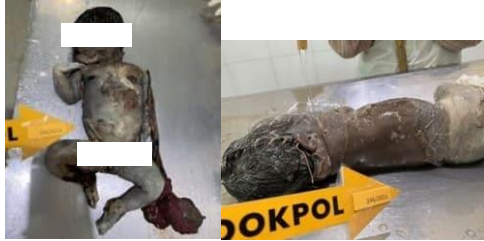
Figure 2. Bruises and skin peeling all over the body

weighing 0.2 kg, the skin of the placenta is decomposed, there are 17 cotyledons, there is body fat ( cervix caseosa ) in the thigh folds.