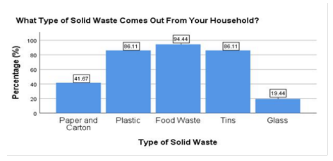
Figure 2 Type of solid waste

The table illustrate types of solid waste comes from the respondent's household. Food waste was the major waste generated in the study area, with 94.4% of respondents saying they generated food waste as solid waste. Meanwhile, plastic and tins share the same portion of respond with 86.11% out of 36 respondents as the second highest solid waste generated from household. 41.67% respondents generated paper and carton and the rest (19.44%) of the respondents said they generated glass as their household solid waste. Majority of respondents generated food waste indicates that every day, high volume of food waste is disposed in every household. Food waste produces methane gas as the food rot and degrades. This might cause environmental problem if food waste is not properly discarded. Furthermore, carelessly disposed of food waste might clog drains and impede rivers, perhaps resulting in floods during the rainy season. Because plastic is not biodegradable, the huge volume of plastic garbage created is expected to pose implications for disposal. Hence, another alternative of using plastic or better way of disposal should be further discussed. Even if only 19.44% of respondents generated glass as their solid waste, but proper care of glass solid waste should be taken because it can cause major environment impact due to melting activities. CO2 is produced by the burning of natural gas or fuel oil and the breakdown of raw materials during the melting process.