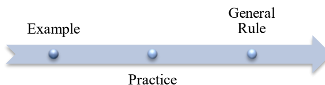
Picture 2. Principle of Inductive Method