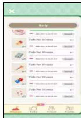
Figure 6. Make your Hand