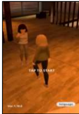
Figure 2. First Page after Registration