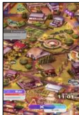
Figure 4. Choose the Place for Conversation