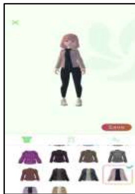
Figure 3. Change your Avatar