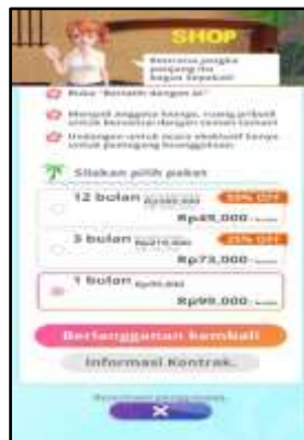
Figure 7. Pay for Subscriptions

The techniques in the Fondi application provide a menu that is quite large and comfortable for beginners and users can feel as if they are in a place and meet people around the world. This makes it easy for students or people who want to practice speaking skills without having to go somewhere to meet people from other countries.