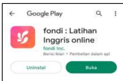
Figure 1. Icon of Fondi