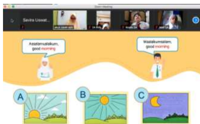
Figure 2. Distribution of Relevant Materials

The design engagement strategy emphasizes strategies that seek to increase students' cognitive engagement. First, the teacher offers a relevant professional and personal English learning experience. Professionally, students can understand the material as "students". Personally, students can implement the material presented in everyday life.