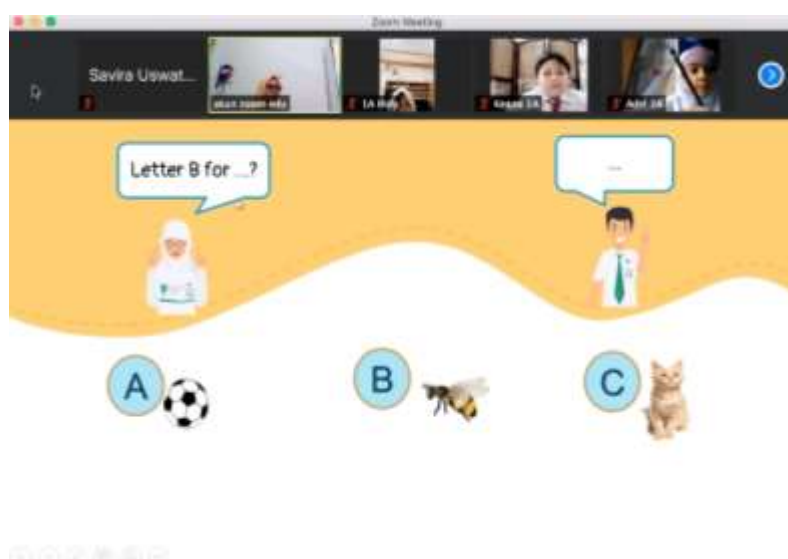
Figure 4. Critical Questions

Second, besides of its relevance, engagement design strategies on the other hand also consider triggering students' critical attitudes. Students are placed in positions where they have to reason questions with a variety of possible answers. The teacher presents the material in the form of questions and answer choices accompanied by pictures. Pictures help students to reason and choose the right answer.