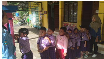
Figure 4. When the child who is the guard has found the attackers, the children will line up to determine who will be the next guard.