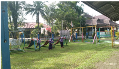
Figure 3. Children who are attackers will look for their hiding place while the guard is counting one to ten.