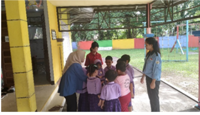
Figure 1. In this activity, the children are doing hompimpah, where this activity is carried out to choose one child who will be the guard while the other child will be the attacker.