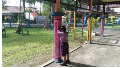
Figure 2. In this activity, the children who are the guards will count on one of the poles that will be used in the game, the children who are the guards will count one to ten and after finishing counting the guards will look for their friends who are hiding.