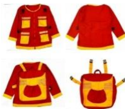
Figure 2. Product Plan