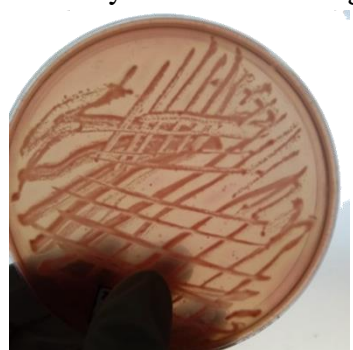
Figure 1. Colony shape and color Klebsiella pneumoniae on Mac media. Conkey

The confirmatory test results showed that the Klebsiella pneumoniae bacteria grown on Mac.Conkey media grew with pink colonies but could not ferment lactose completely. If taken with the ose, it will be attracted because the colony has a capsule. This is in accordance with the statement of Kusuma (2013) which states that Mac. Conkey is a selective medium containing a special dye that can ferment lactose so that bacteria that ferment lactose will grow as red colonies while bacteria that do not ferment lactose will grow as colorless bacteria. Observation of the color of Klebsiella pneumoniae colonies on Mac media. Conkey can be seen in Figure 1.