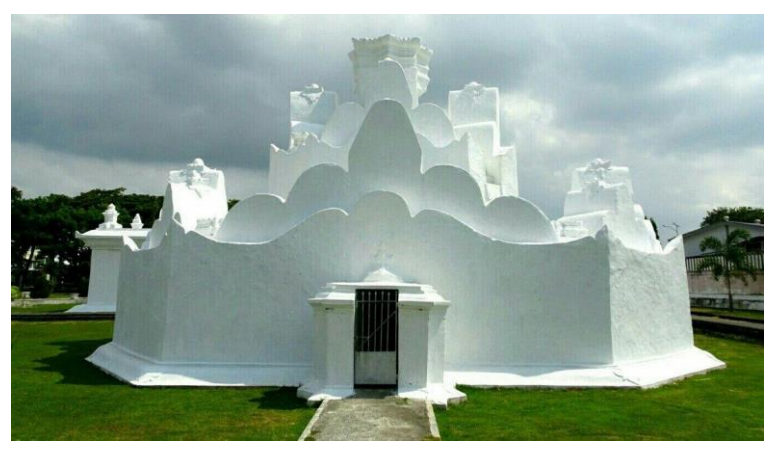
Figure 4. Gegunongan, a mountain-like building in Taman Ghairah

Brakel, like Linehan and Sumukti, is more inclined towards Hindu buildings because of the shape of the mountain, like a pewayangan (puppet) (Linehan, 1951; Sumukti, 1997). However, Shiraishi disagreed with the three because the gegonungan and Taman Ghairah were bright white like bright white blood (Shiraishi, 1990, p. 47) as mentioned in Hikajat Atjeh (Iskandar, 1959, p. 116). Apart from the archaeological analysis, gegunongan and Taman Ghairah are manifestations of the power of the 'Sultan' in Aceh. Reid asserted that the era of Ala'uddin Ri'ayat Shah had given birth to an 'absolute' system of government, culminating in the Iskandar Muda era (1604-1636) (Iskandar, 1980; Lombard, 1986b). This is a sign of the rise of Islam in the Aceh Malay region, which is oriented towards the sultanate system (Burhanudin, 2006), with the Sufism foundation that the sultan must be a "perfect human" (insān al-kāmil) as a title of praise for the 'almighty' sultan who has achieved the highest degree in royal social and political discourse (Reid, 2004). So that, Wessing's findings state gegunongan is the pinnacle of veneration for Sultan Iskandar Muda as a place of meditation in holding his insān al-kāmil title (Wessing, 1988, pp. 177–178).