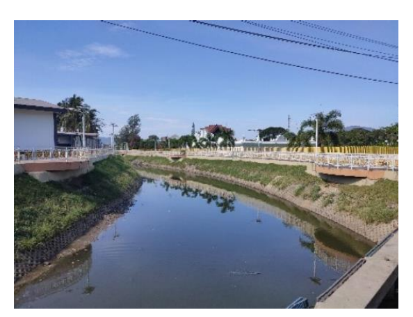
Figure 3. Darul 'Ishki in Taman Ghairah

In modern research, several archaeologists mention gegunongan as a manifestation of Aceh's cultural forms. Them Wessing (1988) mentions that gunongan is a 'symbolic mountain' which is one part of the palace courtyard (garden) as a feature that this is the beautiful garden of the Aceh sultanate (Wessing, 1988, pp. 157–194). Meanwhile, Brakel noted gegunongan was deliberately formed as a mountain, as in the Hindu view of the mountain of the Gods ( Mahameru ) (Brakel, 1975, p. 60), or the center of the universe, the gods lead the world (Fadhil & Fakriah, 2021; Fakriah, 2021).