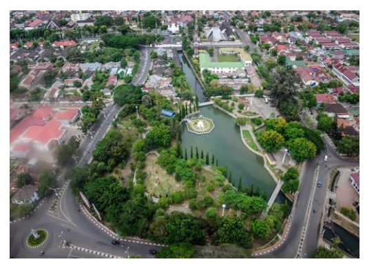
Figure 1. Ghairah Park (from far)

"In Gegunongan there is a cave (guha) with a door covered in silver; on his side, there is the king's cage (kandang baginda), for those who want to enter it are asked to read a prayer (şalawah) to the Prophet Muhammad".