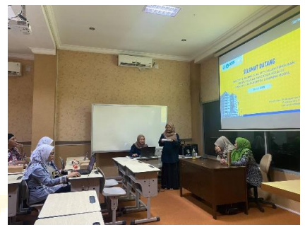
Figure 4. Training to Participants

The fourth stage is the training stage. This core activity is carried out offline in the D4 FIP UM Counseling Room. Activities are filled with the provision of material starting with (1) Dimensions of the Pancasila Student Profile; (2) Application of Strengthening the Pancasila Student Profile; (3) Group Guidance Methods for Strengthening the Pancasila Student Profile; (4) Guidance and Counseling Service Implementation Plan (RPLBK); (5) Media in Learning and Counseling Services; and (6) Media Synchronization in the Pancasila Student Profile. The fifth stage was the closing. Closing activities are filled with providing motivation and filling out the post-test instrument. Motivation was conveyed to all training participants about the importance of counseling teachers in supporting the progress of the nation's children through the application of counseling concepts in the six dimensions of the Pancasila Student Profile. Furthermore, participants filled out the post-test to determine post-training changes. There are 8 questions with answers between 1 and 4 which refer to the following conditions: 1. strongly disagree 2. disagree 3. agree 4. strongly agree. Based on the comparison of pre-test and post-test results that have been filled in by 20 participants, it shows that there is an increase. The Wilcoxon signed rank test was conducted to see statistically the improvement that occurred, with the following results.