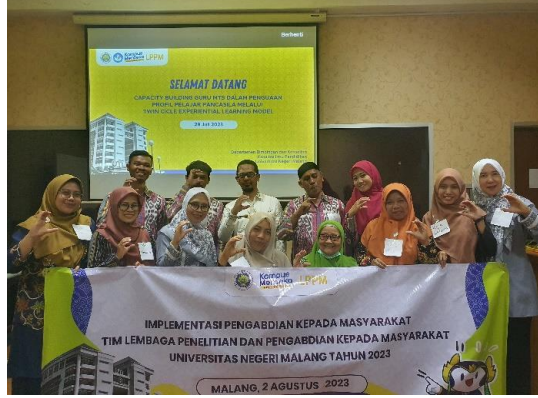
Picture 1. Group Photo with All Participants in Offline Service Activities

The implementation of Capacity building for MT teachers in Strengthening the Profile of Pancasila Students through the Twin Cicle Experiential Learning Model was carried out online and offline. Online activities were carried out on July 29 and 30, 2023, while offline activities were carried out from August 2-4, 2023. The activity was successfully carried out smoothly.